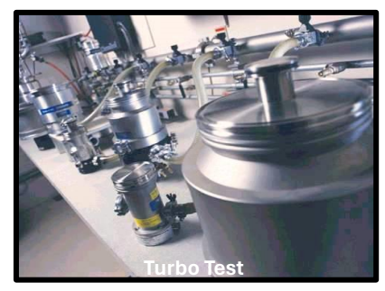
Expert Vacuum Equipment Remanufacturing since 1972

Unit will be re-assembled in one of our dedicated manufacturing cells. Utilizing in-house equipment, the pump's rotor assembly will be properly adjusted and dynamically balanced.